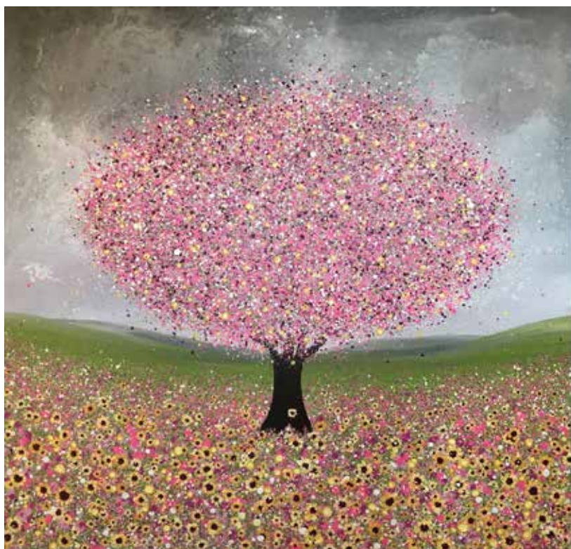
'Smiles On A Grey Day'

Original contemporary paintings, depicting life's beautiful views, with a playful sense of fun, colour and light